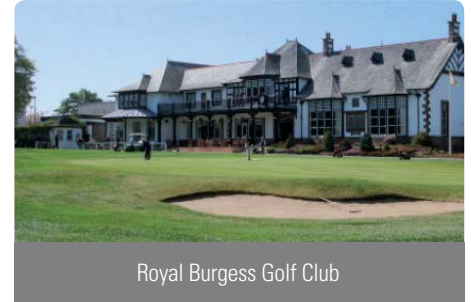
Royal Burgess Golf Club

Organisation of the Scottish Branch Golf Day, Thursday, 10th September 2009 is already underway. The venue will again be the prestigious Royal Burgess Golf Society in Edinburgh. There is the opportunity for up to 36 players, playing threesomes to participate. Registration is recommended as soon as possible.