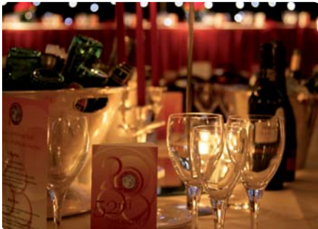
The Guild's Annual National Dinner

The Guild's Annual National Dinner took place on 10th March at the Grosvenor House Hotel, London.