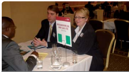
Stopaq meeting Richardson Oil & Gas - Nigeria at Pipelines

Working with the Pipelines Industries Guild and other partners and stakeholders including the Society of British Gas Industries Aberdeen City